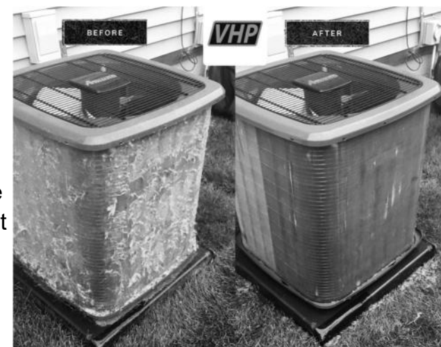
Before this AC condenser was serviced it was putting stress on the system and had decreased performance. The difference system maintenance makes is amazing!