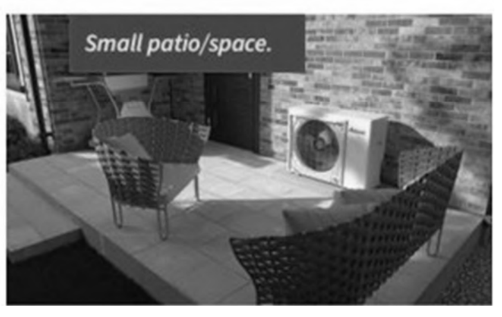
See reverse side for a special promotion. ———